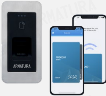
iOS & Android

The Armatura ID mobile app offers a consistent user experience across iOS & Android platforms. Opening doors by simply presenting your smartphone to the reader. Supports both NFC and Bluetooth communication methods, extending mobile access functions to almost all smartphone users.